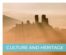
CULTURE AND HERITAGE